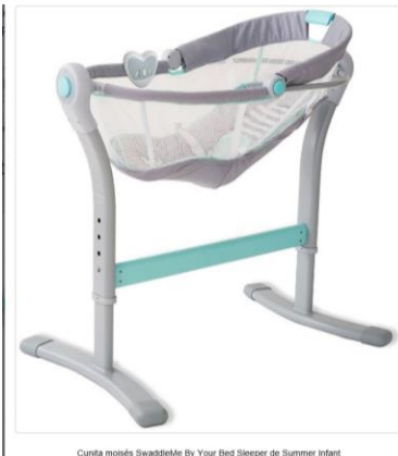
Cunha moisés SwaddleMe By Your Bed Sleeper de Summer Infant

What to do: Consumers should immediately stop using the inclined sleeper and contact Summer Infant for a cash refund or voucher. Consumers can contact Summer Infant online at www.summerinfant.com and click on "Safety Alerts and Recall Information" or at 1-800-426-8627 from 9 a.m. to 5 p.m. ET Monday through Friday for more information.